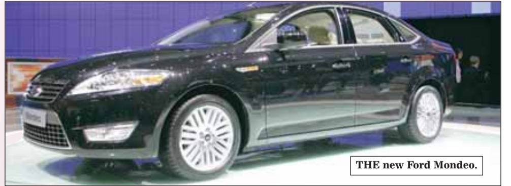
THE new Ford Mondeo.

Available to order now at Ford dealerships across the