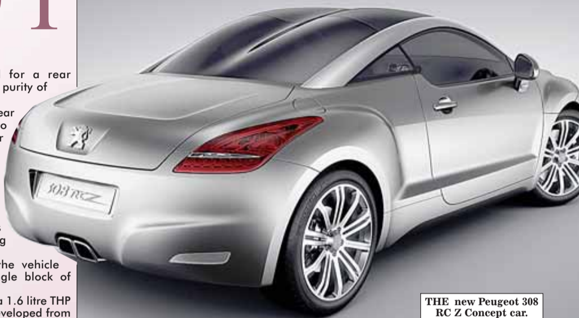
THE new Peugeot 308 RC Z Concept car.

The 308 RC Z is powered by a 1.6 litre THP turbo-charged petrol engine developed from the EP6DTS engine, normally found under the bonnet of the 207 GTi, but now with a maximum power output of 218 bhp.