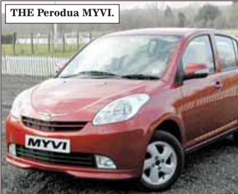
THE Perodua MYVI.

MacPherson front struts and a rear torsion beam with coil spring.