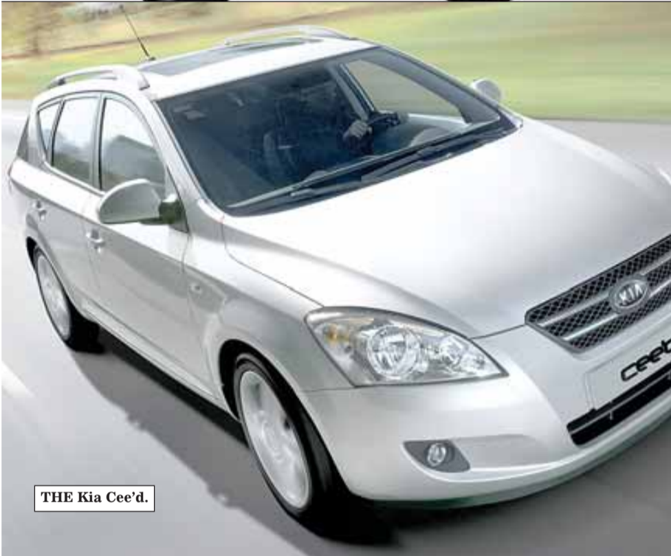
THE Kia Cee'd.