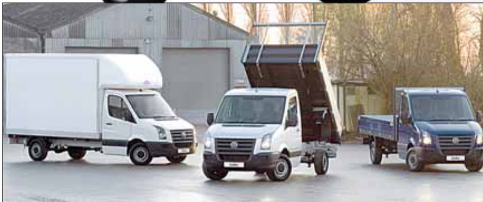
VOLKSWAGEN has introduced a number of off-the-shelf conversions for its Crafter range.

VOLKSWAGEN Commercial Vehicles is demonstrating its commitment to van buyers with a number of off-the-shelf conversions for its Crafter range.