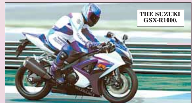
THE SUZUKI GSX-R1000.

"In dealer showrooms, it has been moving almost as fast, now leading the sales charts and outselling its rivals comprehensively."