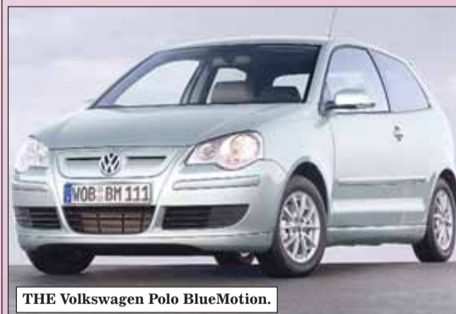
THE Volkswagen Polo BlueMotion.

THE Volkswagen Polo BlueMotion is available for ordering ahead of its arrival in the UK in October. Promising outstanding fuel efficiency and carbon dioxide emissions of just 99 g/km, the new model will be priced from £11,995 for the BlueMotion One, while the BlueMotion Two, with higher levels of equipment, starts at £12,845.