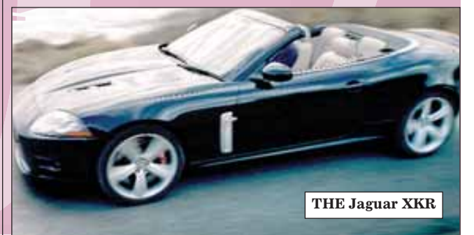
THE Jaguar XKR

The revised price of the XKR coupe is now £70,097 while the convertible is now £76,097.