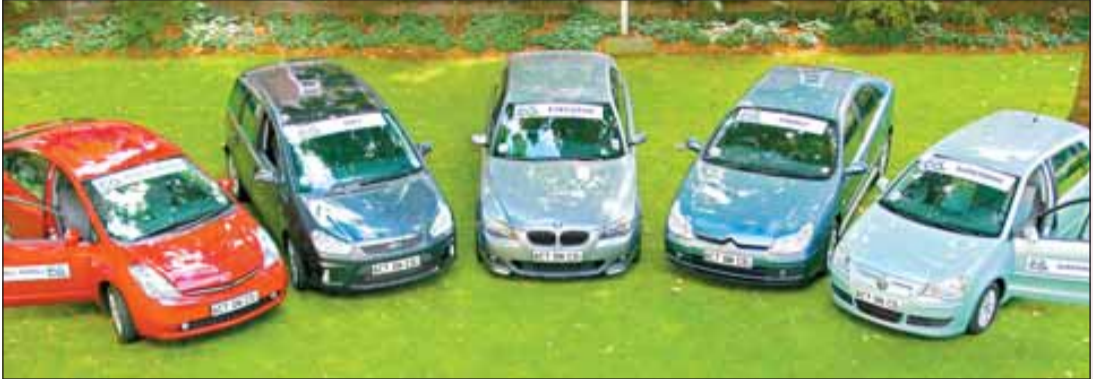
A SELECTION of some of the lowest CO2 emitting cars in their classes.