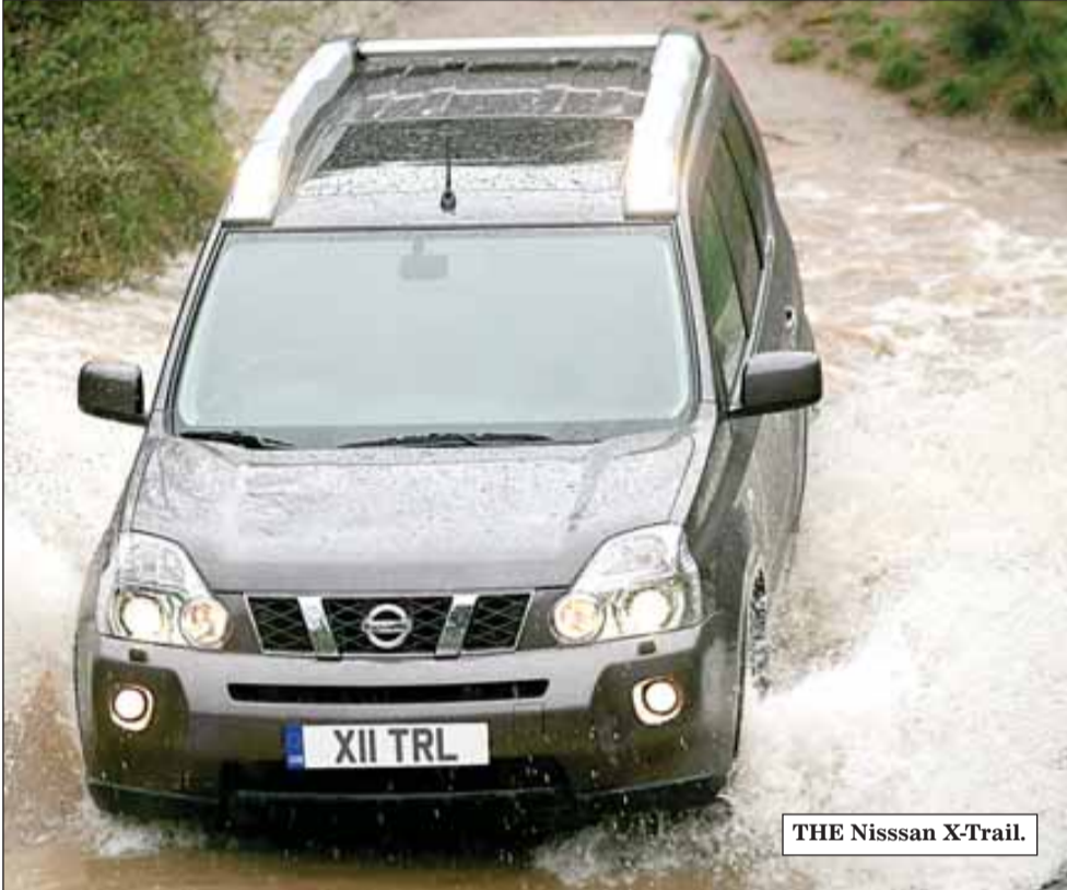
THE Nissan X-Trail.